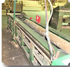
WG Benjy whole log peeler