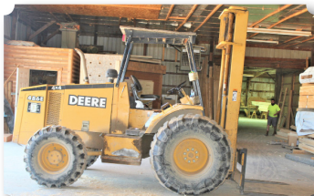
(1) of (2) JD Model 486E All Terrain Forklifts