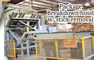
Package Breakdown hoist w/ stick removal