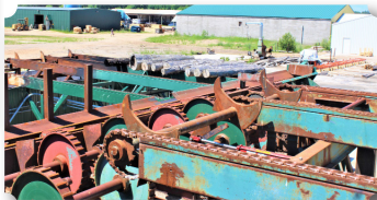
HMC V206 Debarker w/ rebuild and new PLC Controls

Auctioneer's Note: 37 Acres True Industrial Zoning with Level 1 Roads Plus diversified, well maintained equipment still in operation until December 1, 2019.