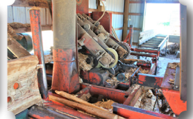
Morbark PS8 Post Peeler