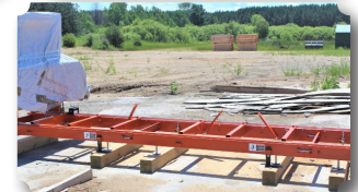
Woodmizer LT 15 band mill 40' length with kohler engine