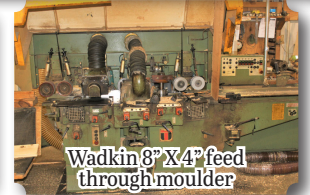
Wadkin 8" X 4" feed through moulder