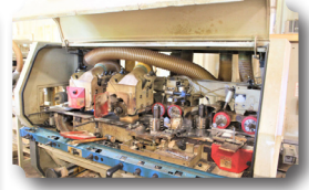
Weinig 12" X 7" Unimat 23E Moulder