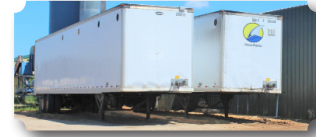
(5) Chip and Dust Trailers (Closed Top) 53'