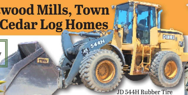
JD 544H Rubber Tire Wheel Loader

End Matching line for wide plank flooring and Tongue and Groove Siding and Panels Terms: Equipment: Payment in Full Day of Sale: Cash, check, credit card. 10% buyer's premium for onsite purchases and 13% for off site purchases.