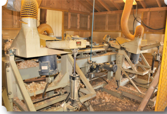
W G Benjy Profiler for hand scrape look