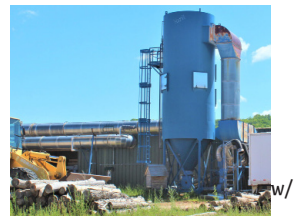
Torit High Volume Dust Collector, bag house w/ spark detector